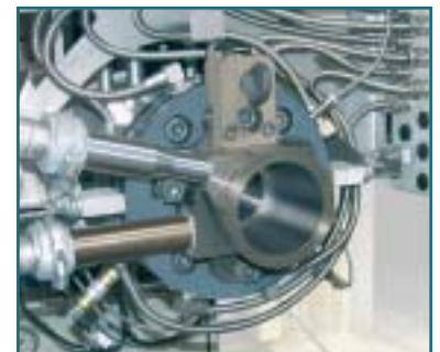
Process water piping (detail)

Data exchange with other system controls also available as an option.