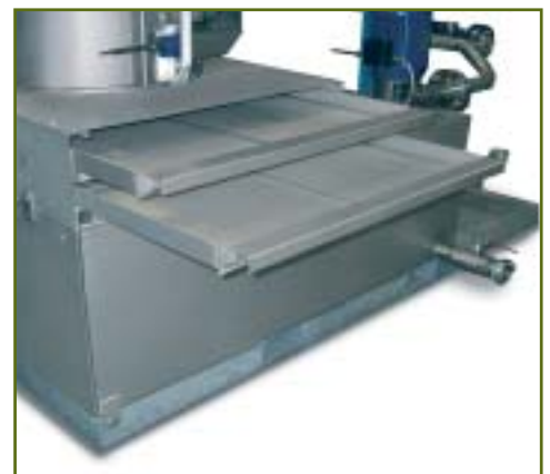
Drawer filter (opened)