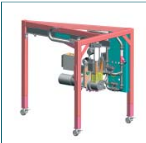
Movable frame, 3 pillar design