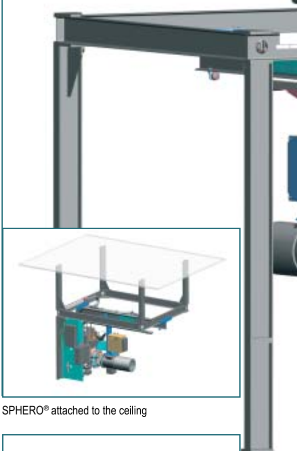
SPHERO® attached to the ceiling