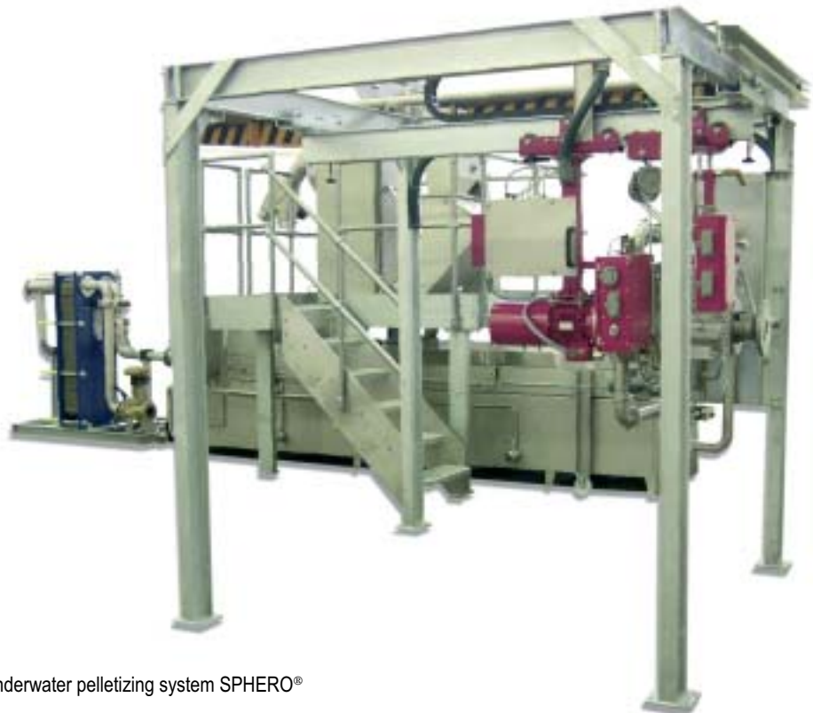
Underwater pelletizing system SPHERO®