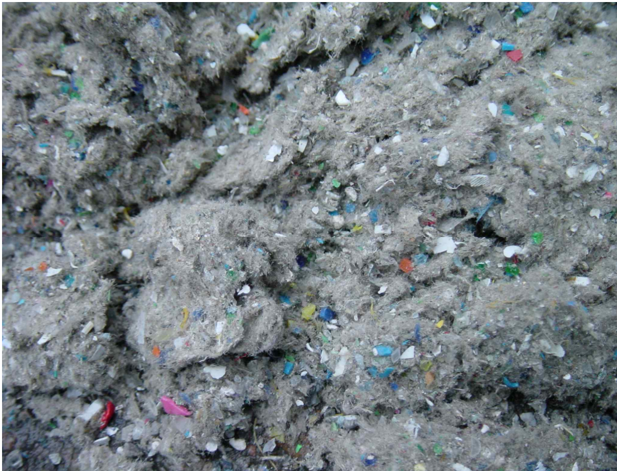
Paper fibers and dirt separated with the Dry Cleaner

Dry mechanical cleaning of the plastic waste significantly reduces the effort required for the downstream wet washing. The undesired paper, dirt and organic residues are separated from the plastics. Therefore the waste stream is dry and the amount of waste generated by wet washing technology is minimised by up to 50%. In addition, the costs for waste disposal are significantly reduced.