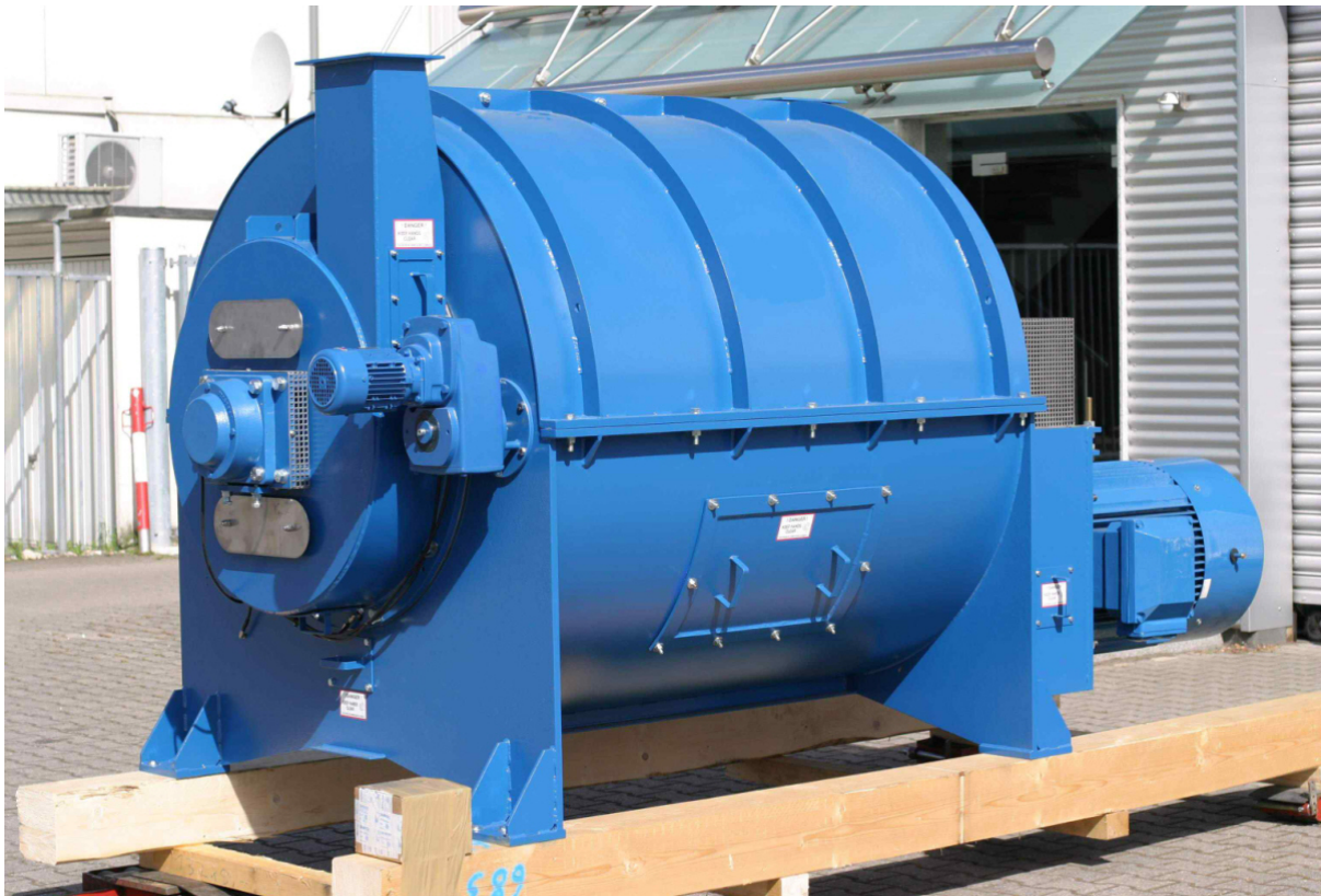
Dry Cleaner MR110

Pla.to has developed a new system for a mechanical pretreatment of waste plastics. Fast rotating blades in the centrifuge subject plastics to significant mechanical stress and deformation.