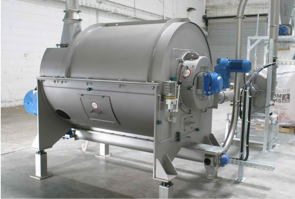
MR37 in stainless steel