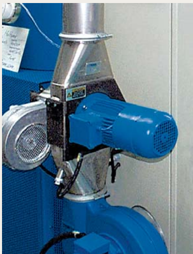
Pelletiser with air cooling