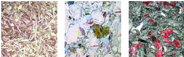
Wood, paper, and plastic materials after shredding.