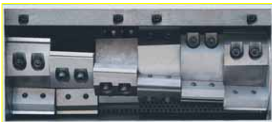
Staggered Blade Closed Chamber

AutoGrind General Purpose Grinders are designed for central or beside the press operation. They are the perfect choice for injection molding, blow molding and extrusion. The standard soundproofing makes these the quietest grinders on the market. The swing away material blower and cyclone are also standard with stainless steel tubing. Heavy duty construction with hardened blades makes Autogrind the most trouble free grinders on the market today.