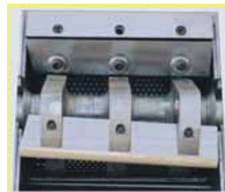
Angled Cut Open Chamber